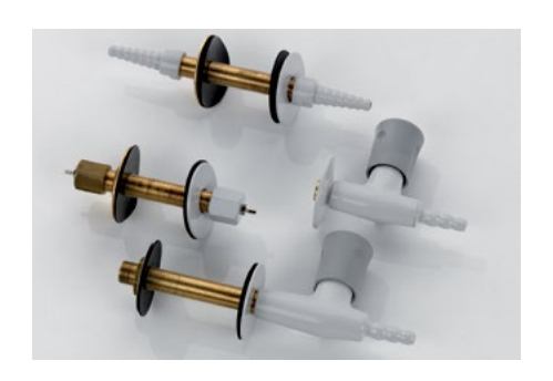
Side wall service taps are easy to install