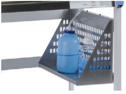
SmartPort floor stand hanging shelf to keep area beneath cabinet clear to ensure adequate legroom for a comfortable working position