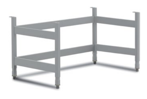
Manually adjustable stand enables cabinet to be set at a comfortable working position between 750-950mm