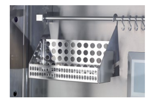
Utility basket with hanging bar increases flexibility of the working area and helps improve organisation