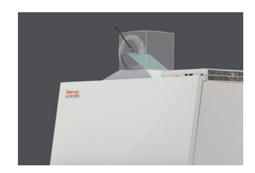
Direct duct exhaust can be added when working with trace amounts of volatile chemicals