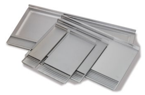
Configurable work surface improves flexibility of the working area